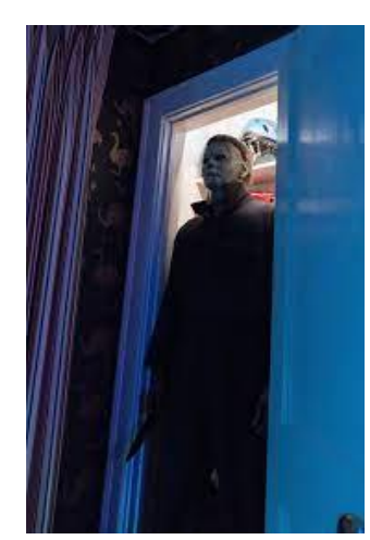
could not move.

Although Hallowe'en has passed we felt that we ought to include a little snippet of Leo's story: