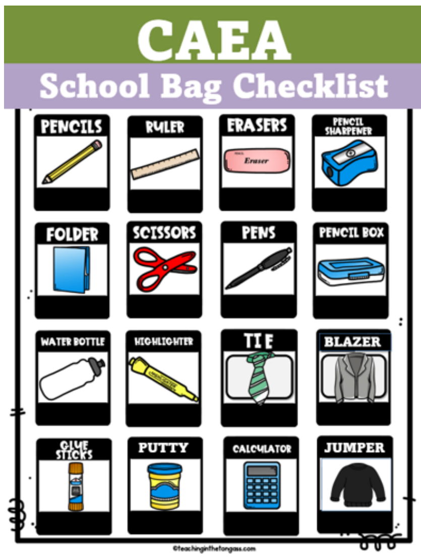
Example of scissors available in school

Students are welcome to bring in stationery from home and are encouraged to bring a pencil case which they can carry with them. If your child brings any stationery from home, please can you ensure that scissors are plastic and in line with those provided by the school. Please be assured that the school has scissors available for all students, as well as stationery resources for those who may need them. Specialist scissors are also available from the Occupational Therapist if students are struggling to use the ones available in class.