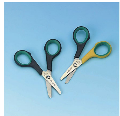
Example of specialist scissors available